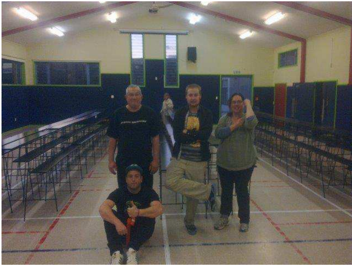
Titahi Bay Lions have this now as an annual activity and are pleased to be helping Titahi Bay Horticultural Club. The Lions motto is 'we serve'.